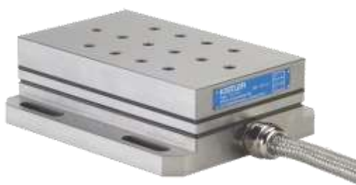
Fig. 2. External view of three-component dynamometer using the piezoelectric principle of force measurement.

When diamond smoothing of parts with a round profile, the blasting force can be changed and change direction when using different designs of mandrels.