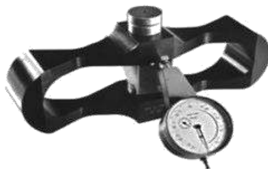
Fig. 1. Mechanical dynamometer

There are two types of mechanical dynamometers: spring and lever. In a spring dynamometer, a force or moment of force is transferred to a spring, which, depending on the direction of the force, is compressed or stretched. The amount of elastic deformation of the spring is proportional to the force of impact and is recorded. In a lever dynamometer, the action of the force deforms the lever, the amount of deformation of which is then recorded.