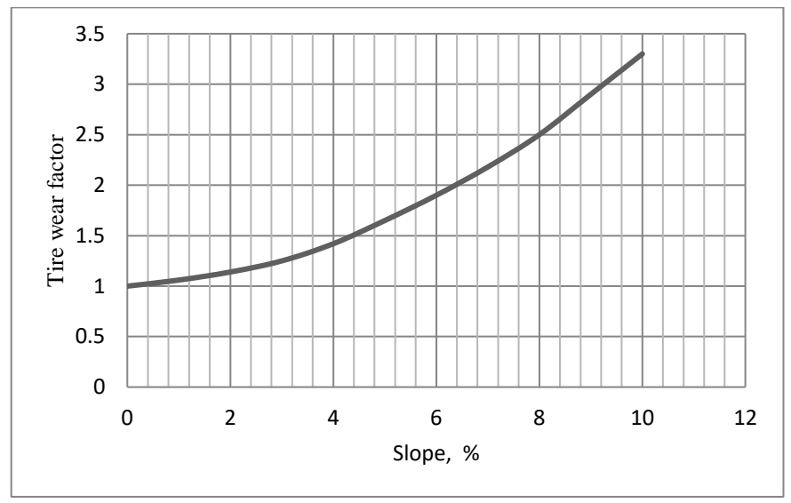
Fig.2. Dependence of the relative wear of tires on the value of the longitudinal slope

All of the previous analyzes have examined the effect of road gradient on tire life in mountainous conditions, i.e. asphalt road at the pass. The influence of the slope of quarry technological roads on the resource of tires has not been studied sufficiently. Based on the analysis of studies, an attempt was made to assess the impact of the slope of the technological road of the Navoi Mining and Metallurgical Combine (NMMC) on the tire resource.