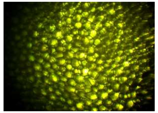
4-picture. Cross-section of the parietal portion of the Cavar plant of the" Uzbekistan 20 " Variety and the appearance of conductive tubes, parenchyma cells in it.

a wide thin-walled parenchyma, in which the single separation channel cells are wide-circleshaped holes .(Figure 4)