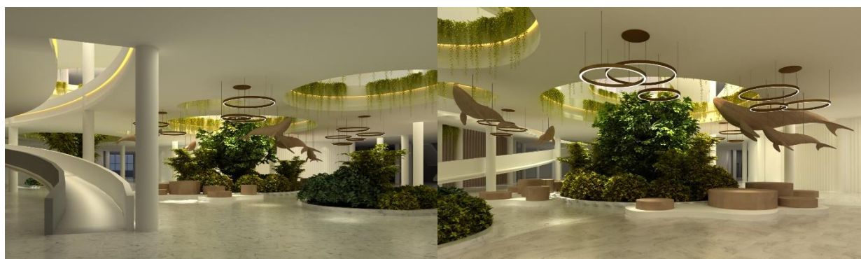
Figure - 2. Diploma project "Multifunctional media library in Tashkent". Interiors. Author: Abdugaffarova G.A.

The concept of this project is to create a modern laconic exterior and a comfortable interior (Fig. 2), to create a cozy atmosphere so that those staying in the media library can freely receive knowledge, energy, be inspired and not feel any inconvenience. The space itself should have a good perception of new information and knowledge.