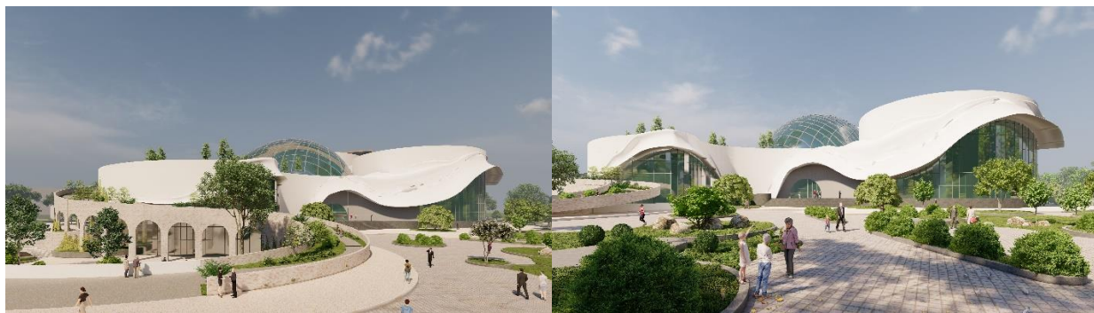
Figure - 1. Diploma project "Multifunctional media library in Tashkent". Perspective drawings. Author: Abdugaffarova G.A.

The concept of this project is to create a modern laconic exterior and a comfortable interior (Fig. 2), to create a cozy atmosphere so that those staying in the media library can freely receive knowledge, energy, be inspired and not feel any inconvenience. The space itself should have a good perception of new information and knowledge.