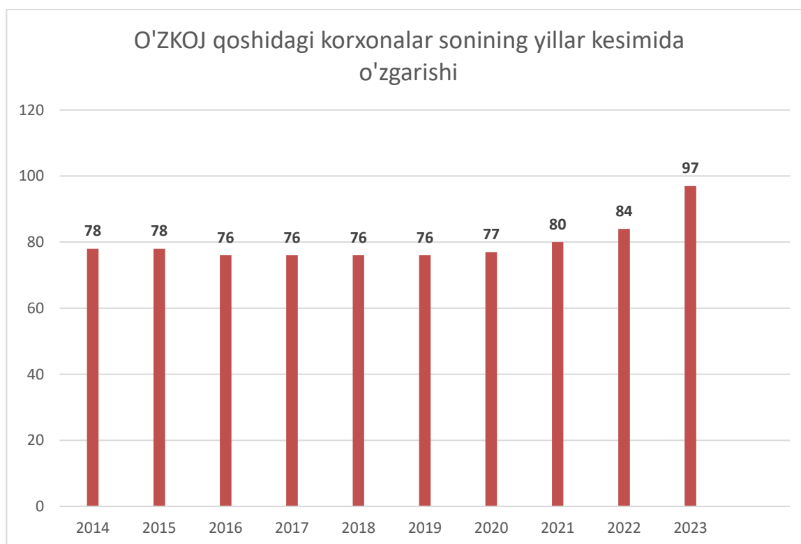
Diagram 1 8

There are 648 blind persons working in UzKOJ enterprises across the country. These enterprises are directly important in ensuring the employment of the blind.